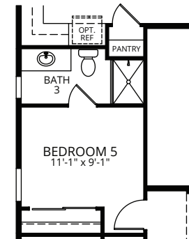
OPT. BEDROOM 5 SUITE